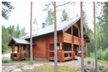
7 Honkalinna ★★★★★ 10+(4) person