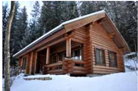
2 Mäntytupa ★★★★ 2+2+(2) person