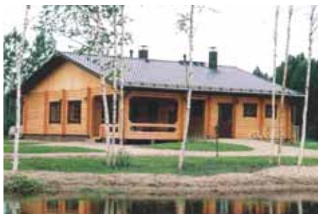
8 Joutsenlampi ★★★★★ 6+3+(5) person