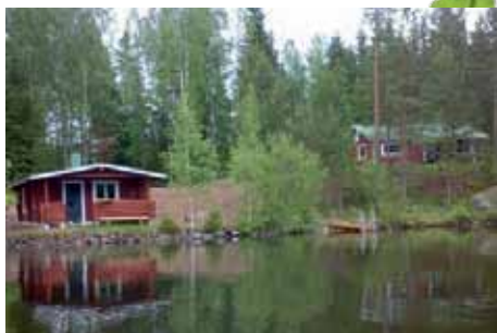
12 Harjula (Nostalgia cottage) 3+(4) person