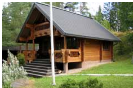
11 Katajarinne 2+2 person