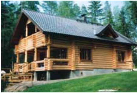
1 Kurkilinna ★★★★★ 6+2+(5) person