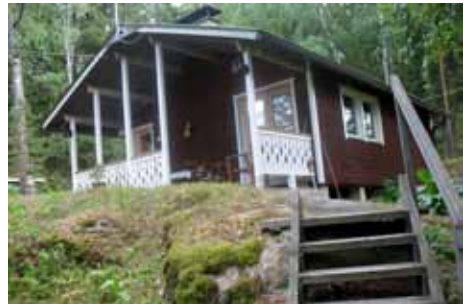
4 Kotomökki 2+1+(1) person