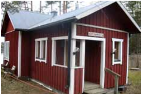
3 Säveltupa 2+1+(1) person