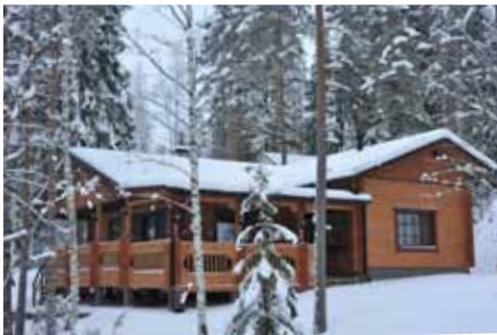
5 Rantamökki E1+E2 6+3 person