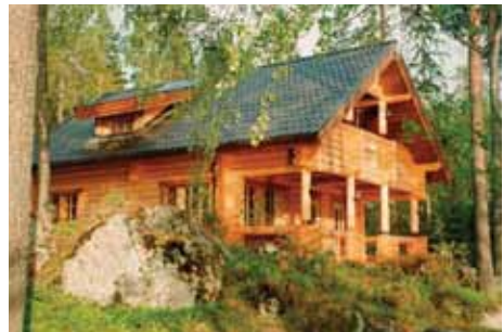
6 Isokoskelo ★★★★★ 6+(2) person